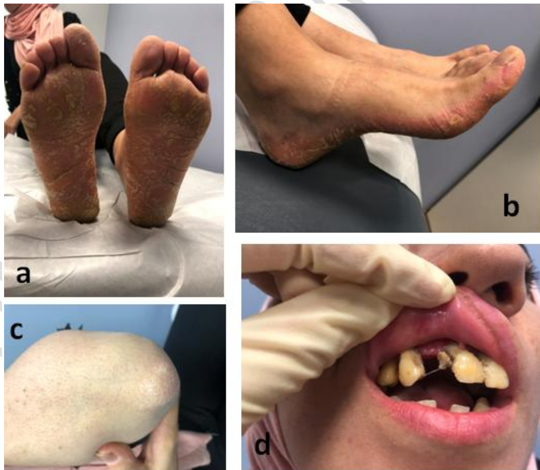
Fig. 4: a, b and c): skin redness and thickening; d): aggressive periodontitis