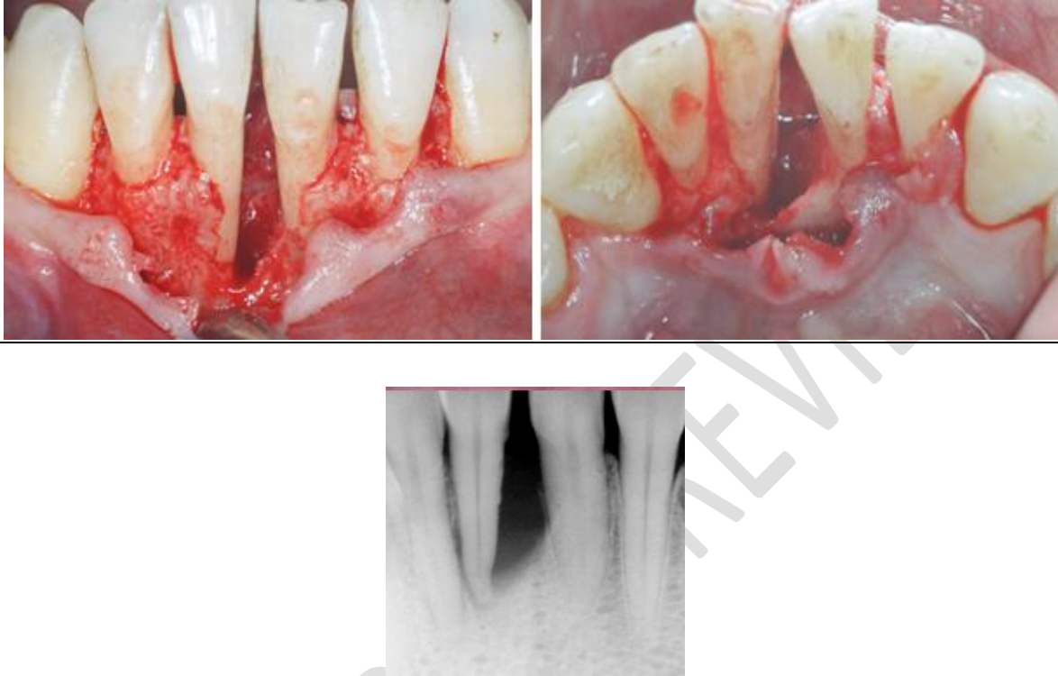
Fig. 1: Localized periodontitis

All forms of periodontitis, no matter the type or classification, can lead eventually to tooth loss if left untreated [2] (Figure 1).