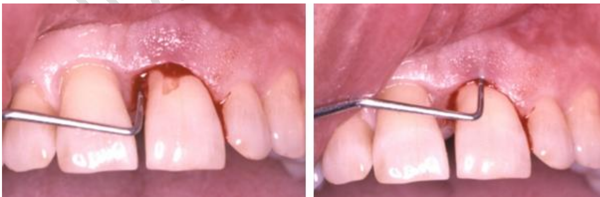
Fig. 2: Periodontal pockets

Periodontal pockets that are considered characteristics of the disease become evident. They result from severe inflammation leading to alveolar bone loss [3] (Figure 2).