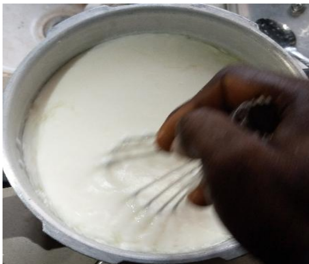
B. Smooth-and-creamy Product