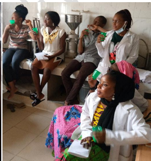
C. Panel of Taste Analysts