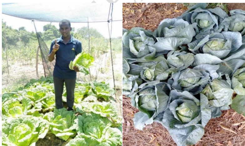
Figure 4: Brassica rapa under 50 % black shade net and Brassica oleracea harvested from 50% black shade net field at Pwani University farm.

During the second trial, only the cabbage crop grown under shade nets survived. However, there were no significant differences in the number of cabbage heads due to the use of 50% and 70% shading. The use of 70% shading on Brassica rapa recorded an insignificant 10% and 15% more cabbage heads than in 50% shading during the first and second trials, respectively. Despite the high air temperature experienced during the second trial, the performance of the cabbages were remarkable (Figure 4).