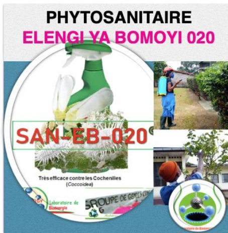
Figure 2. Phytosaneb-020

at the Bioenergies laboratory of the Faculty of Science and Technology of Loyola University of Congo (ULC) on Mealybug Planococcus ficus populations (adults, nymphs, and eggs).