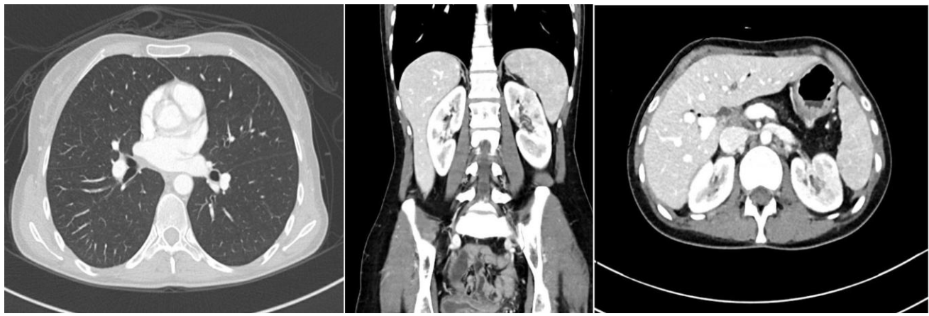
Figure 2: CT chest and abdomen after treatment.