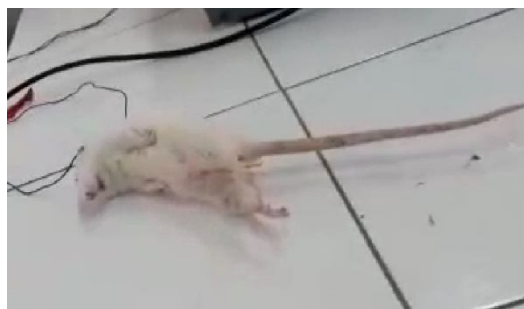
Figure1:Extension phase of Wistar Albino rat.