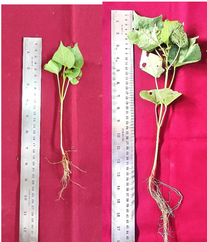
Fig 1. T 1 -Control Seedling length at 30 DAS

influence on germination of seeds may be due to growth promoting substances in cow urine [14]. Similar results were obtained by kumar et al., 2017 in cotton with cow urine 6% and Desai et al. [17] also recorded similar results in papaya. Shatpathy et al. [18] obtained similar results with SA 100ppm in rice.