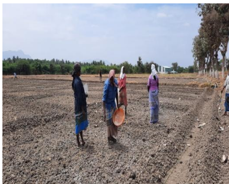
Fig 3. Fertilizer application