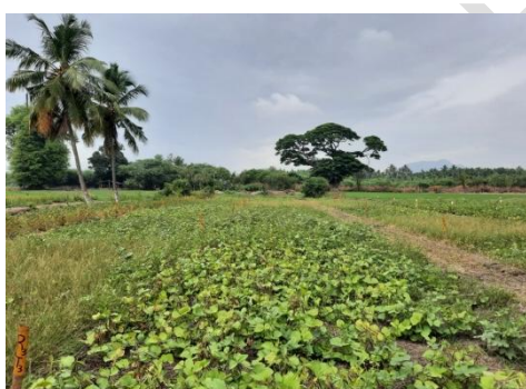
Fig 5. PE Pendimethalin (30% EC) @ 1 kg a.i ha -1 fb EPoE Propaquizafop 2.5% + Imazethapyr 3.75% ME (RM) @ 125 g a.i ha -1 (T 3 ).