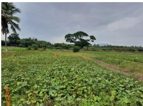
Fig 4. PE Pendimethalin (30% EC) @ 1 kg a.i ha -1 fb EPoE Imazethapyr 10% SL @ 100 g a.i/ha + Quizalofop-ethyl 5% EC @ 50 g a.i ha -1 (Tank mix) (T 6 ).