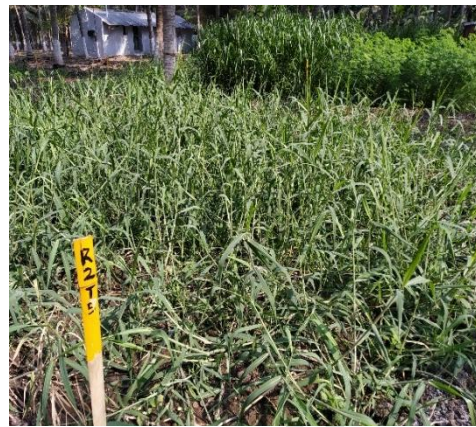
Fig 3 Brachiaria mutica