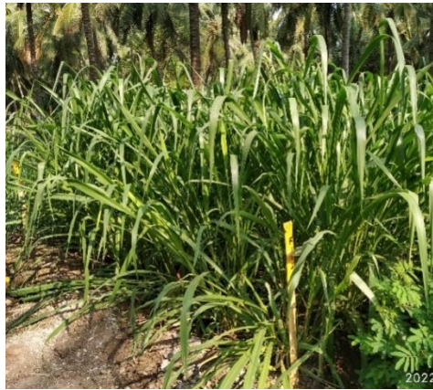
Fig 2 Panicum maximum