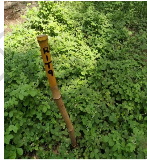
Fig 5 Macroptilium atropurpureum