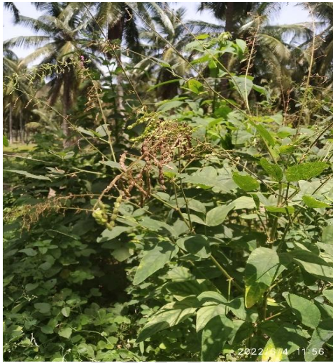
Fig 4 Desmodium gangeticum