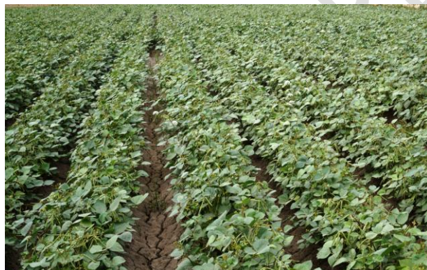
Summer mung crop under Frontline demonstration with improved agronomic practices