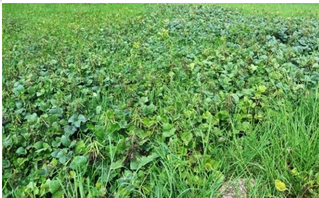
Summer mung crop with higher weed incidence and stunted crop growth under Farmer's Practice

Gross returns were estimated based on the prevailing market prices and the yield obtained by the farmers during both the years. For obtaining input cost, the sum of expenditure on land preparation, planting method, fertilizer, fungicide, insecticide, herbicide, irrigation, labour and harvesting cost, etc. were calculated from each plot. Benefit:Cost was calculated as ratio of net return over cost of cultivation. The extension yield gap, technology yield gap and technology index were calculated [6,7]. Extension gap refers to the difference between demonstrated plot yield and farmers practice plot yield, whereas,