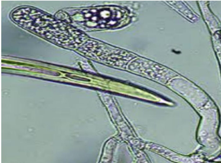
Plate 3. Pictomicrograph of Golovinomyces cichoracearum