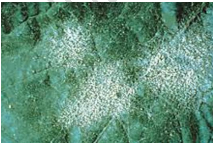
Plate 4 Confirmation of Koch's Postulate