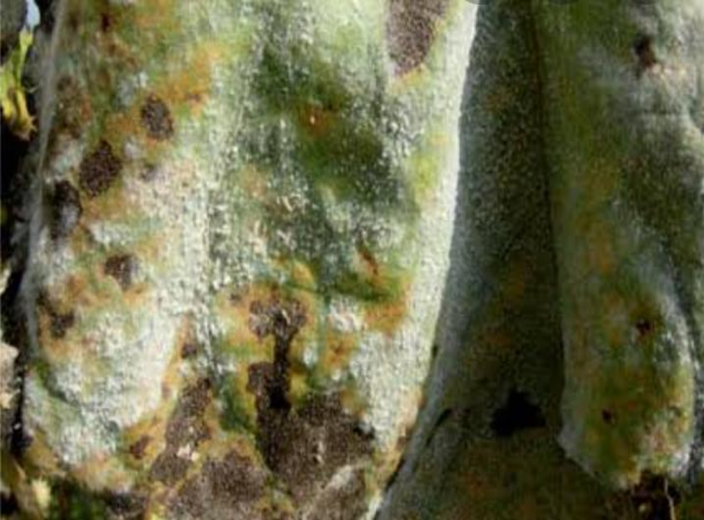
Plate 1. Whitish Powdery Mildew Symptoms observed in the field.