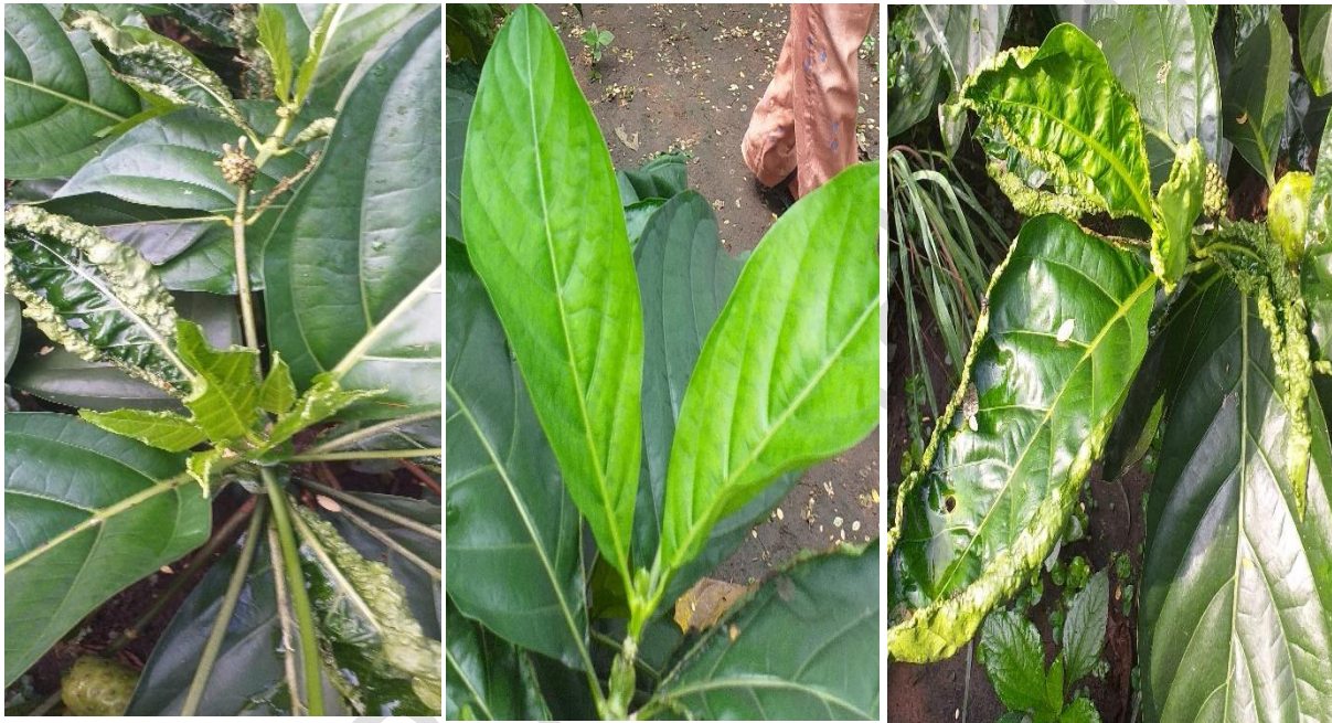
Plate 1. Foliar phytoplasma disease of Noni, sandwiched with the uninfected. Infected shoot are shorter with reduced leaves shrinking upward and inward.

Typical features of the affected shoot in the field with FPD are stunted growth, reduced leaf size with puckers (upward and inward) and lamina shrinkages from petiole to the tip ( Plate 1 ). Such samples were collected from Dilomat farm and conveyed to the Department of Microbiology, Rivers State University, Port Harcourt for analyses.