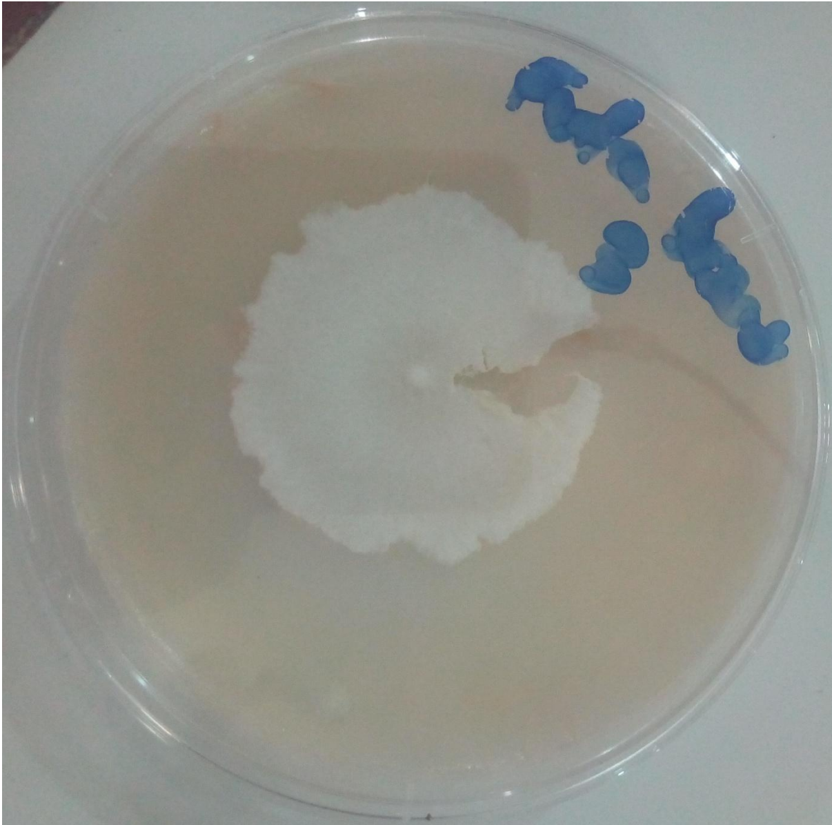
Plate 2: Macroscopic view of Saccharomyces cerevisiae from vended flour-made products