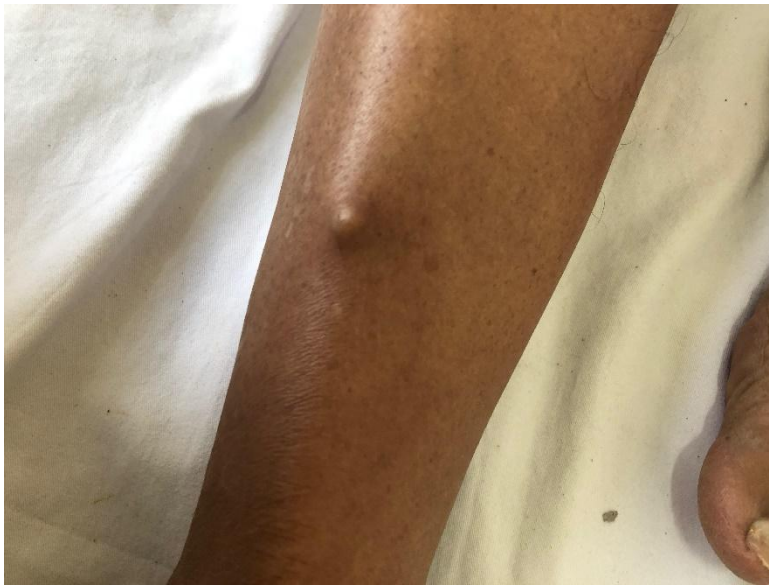
IMAGE 1.Small nodule present over the right shin

,round , swelling was present over the right thigh on the medial aspect just below the inguinal region .It was 5cmX 5cm in size ,hard in consistency ,non-tender and non-mobile .According to the patient this swelling had been present since 2 years but had progressively increased to current size .Another swelling was observed on right shin (image 1) dorsum of right foot .Pulse -72bpm,BP-170/90mm Hg,RR-15bpm. .Systemic Examination was normal except for a soft systolic murmur in the pulmonary area.