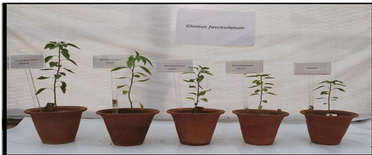
Fig:2 Effect of different doses of mycorrhiza on plant height

The present study was done with the objective of best dose of mycorrhization in Capsicum annum plants. A pot experiment was conducted in screen house of Plant Pathology, CCS HAU, Hisar, to see the effect of Glomus fasciculatum with different doses. Mycorrhizal colonization in roots and number of sporocarps in soil was calculated at 30, 45, 60 and 90 days after transplanting. Plant height, root length, dry weight of root and shoot and SPAD chlorophyll content at 30, 45, 60 and 90 days after transplanting were recorded. Nutrient content (NPK) at 90 days after transplanting was calculated.