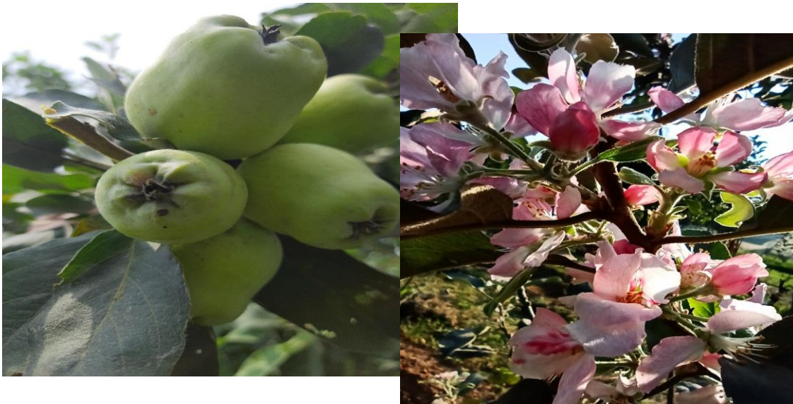
Fig-1. Apple fruit and flowers