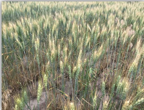
Figure1. Symptoms of terminal heat stress on wheat

reducing yield. The optimal temperature for grain setting and grain filling in wheat is between 19 °C and 22 °C (Porter and Gawith 1999). According to Hurkman et al. (2009), heat stress (37/28°C day/night) for a period of 10 to 20 days after anthesis till maturity lowers grain filling length and maturity; fresh and dry weight, proteins, and carbohydrate contents in grain drastically reduce grain size and yield. Wheat plants in Figure 1. are displaying indications of terminal heat and water stress due to a lack of water. Due to heat stress, the awns and higher heads are going white/chaff colored, while the lower stems are turning yellow straw-colored due to water stress.