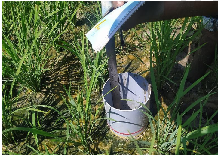
Fig 1. Field water tube installed in AWD plots to monitor water depth

For AWD treatments, irrigation was done to fill up to a thin water layer once the water level reaches 10 cm below soil layer. The irrigation level was monitored with the help of field water tube [13] installed in the plots as shown in the Fig 1 and Fig 2. A practice named “safe-AWD” given by [14] was adopted where the field was irrigated sufficiently during the week of peak flowering to prevent yield losses due to water stress. Cono weeding was done four times starting from 10 days after transplanting at ten days interval in a criss-cross pattern. Manual weeding also was carried out once in 10 days. The buffer and irrigation channels were weeded manually to keep weed growth low. The amount of water supplied to treatments were measured using partial flume installed in the irrigation channel.