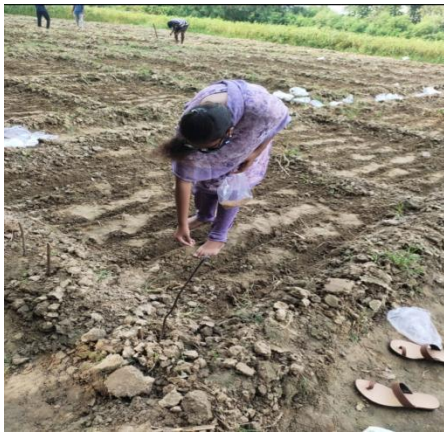
Fig 1 : AT THE TIME OF SOWING