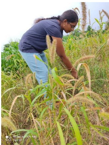
Fig 3: AT THE TIME OF HARVESTING