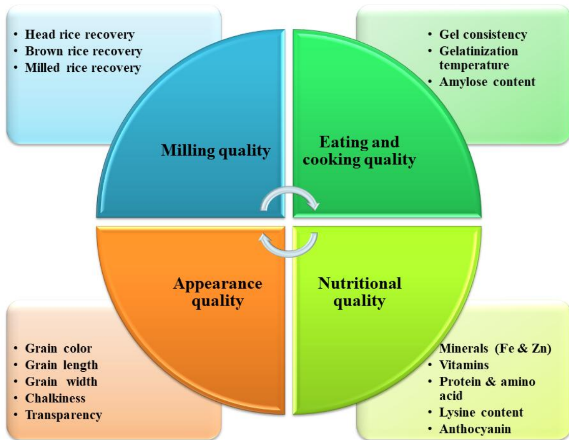
Figure-2: Four facets of grain quality traits in rice