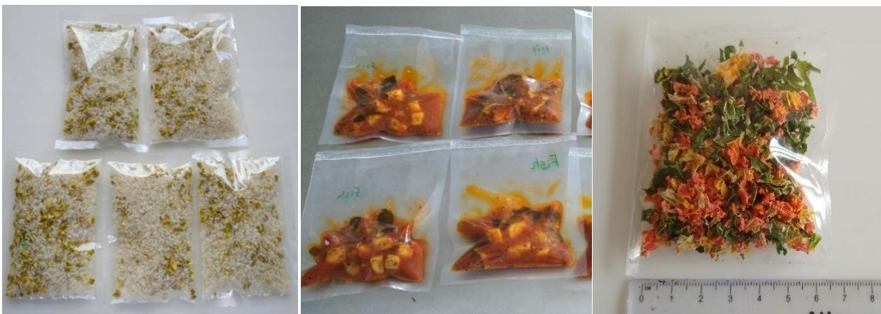
Figure 1: Ready to Serve Mid-Day Meals with three portions