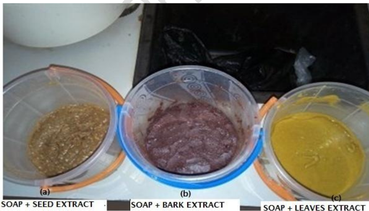
Figure 3: Production of Seeds (a), Barks (b) and Leaves (c) Extracts Soaps.

The same procedure was followed to produce the soap samples for extracts from the Neem barks and seeds (NBRK and NSED) using equal quantities by volume of the active ingredients from leaves seeds and barks, equivalent to 15g for the bark sample (NBRK) and 10g for the crushed seeds sample (NSED).