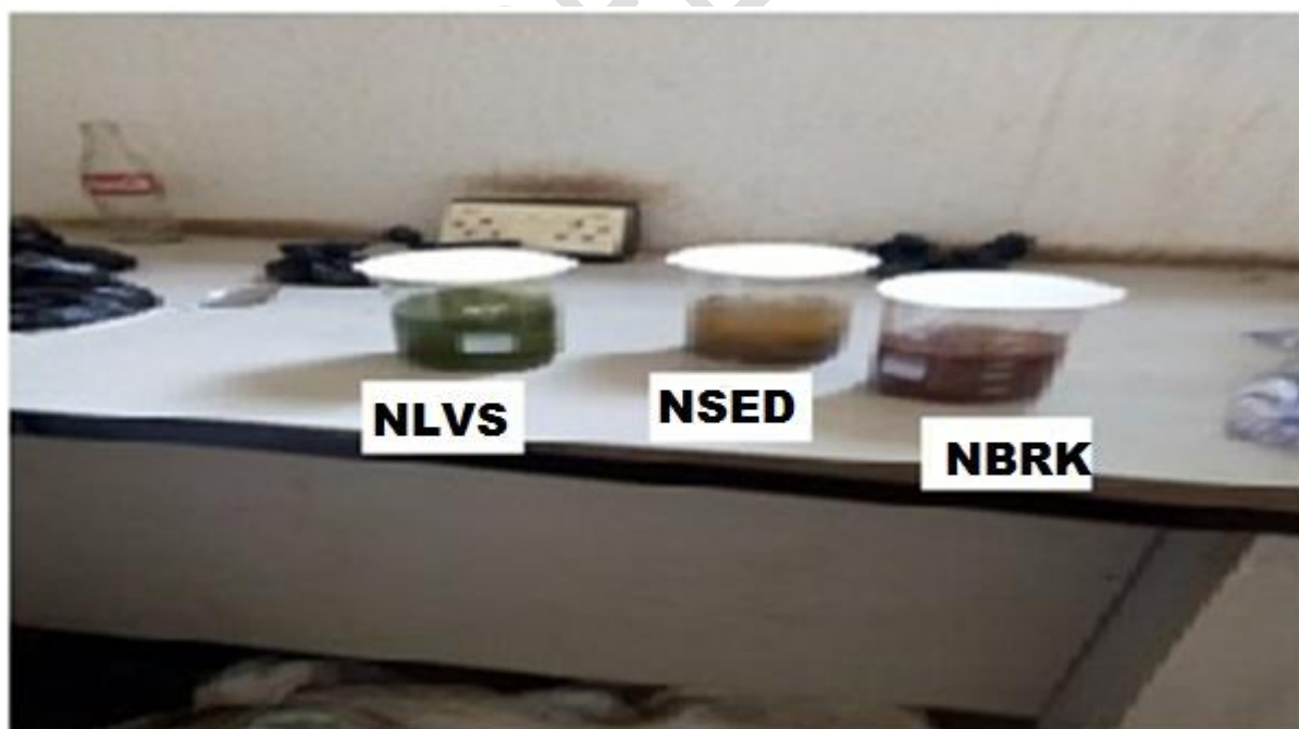
Fig. 2: Pre-fermentation of Neem Leaves (NLVS), Seeds (NSED) and Barks (NBRK) Samples

The first stage in the production of the antiseptic soaps is to ferment the three Neem extracts. The reason why the extracts were fermented is to allow microorganisms, such as yeast and bacteria, to act on the substances to break them into smaller and simpler particles that will produce a soft antiseptic soap. If we use the extracts directly without fermenting, small particles of powdered extracts may remain on the surface of the body after use. The fermentation process was carried out by weighing 70g of each powdered extracts (seed, bark and leaves) and transferring them into three separate 1000 cm 3 beakers. The beakers were labelled as NLVS (leaves), NSED (seeds) and NBRK (barks) respectively. 600ml of distilled water was added to each extract in the beaker and allowed to stand for 48 hours for fermentation to take place. After 48 hours the solutions were then filtered using vacuum filtration machine to obtain clear fermented solutions.