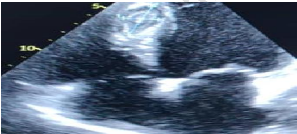
Image 2: Cystic-like image of the interventricular septum

Trans thoracic echocardiography: the presence of a large pericardial effusion in pre-tamponade, with an image of cystic appearance appended to the interventricular septum, measuring 12 x 7 mm