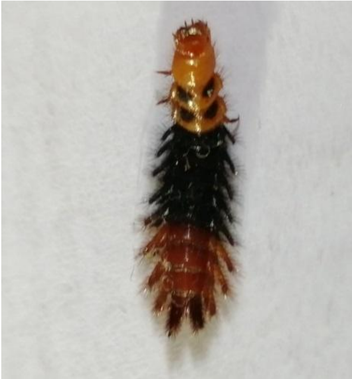
Figure 1. Photograph of the predatory Drilus beetle larvae