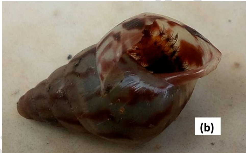
Figure 2. Larva of Drilus sp preying on Limicolaria flammea (a) the predatory larvae crawled on the shell and has bitten the snail multiple times (b) the snail retracted into its shell and the attack continued until the larvae gained entrance into the internal organs of the snail.