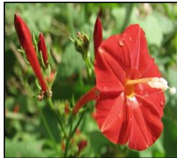
Fig 2. o- I. hederifolia