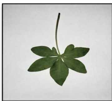
Fig 2. f- leaf of I. cairica