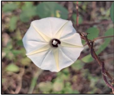
Fig 2. i- I. obscura