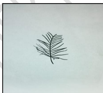
Fig 2.b- leaf of I. quamoclit