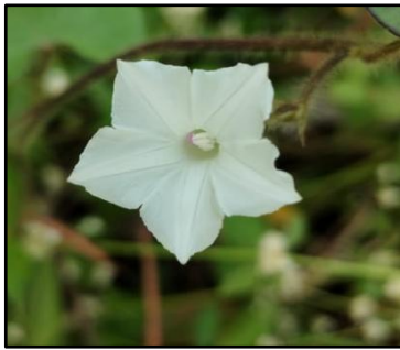
Fig 2. m- I. lacunosa