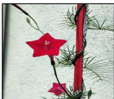
Fig 2. a- I. quamoclit