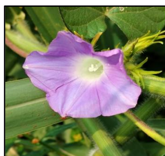
Fig 2. g- I. hederacea