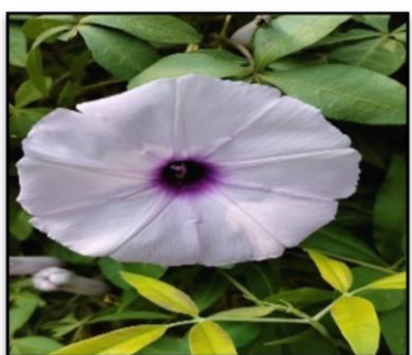
Fig 2. e- I. cairica