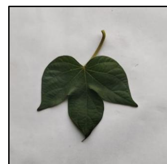
Fig 2.h- leaf of I. hederacea