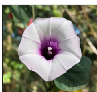
Fig 2. c- I. batatas