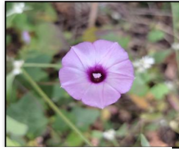
Fig 2. k- I. cordatotriloba