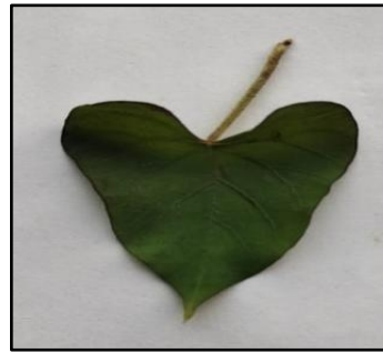
Fig 2.n- leaf of I. lacunosa