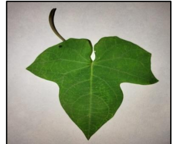
Fig 2.l- leaf of I. cordatotriloba