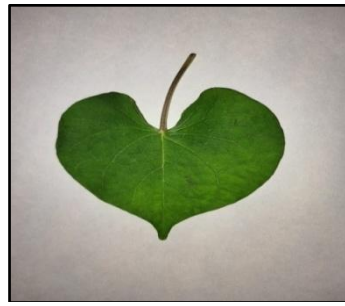
Fig 2.j- leaf of I. obscura