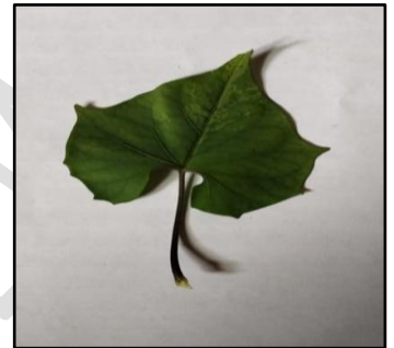
Fig 2.p- leaf of I. hederifolia