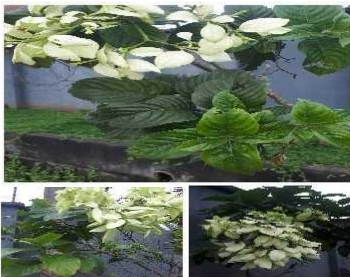
Figure 1: Mussaendaphilippica in its natural habitat