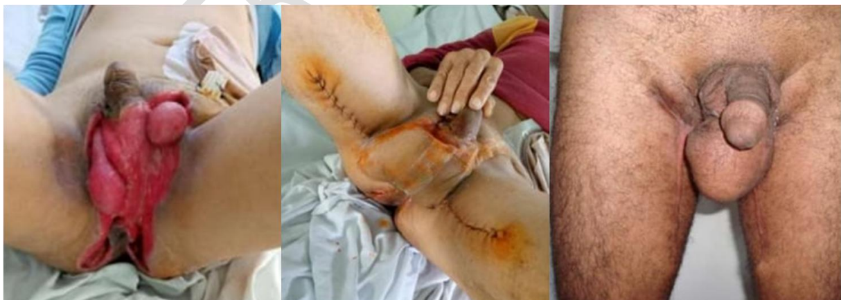
Figure 4 : 40 years old male patient with a history of smoking, hypertension and diabetes has been on antibiotic therapy for 15 days for a recurrent urinary tract infection. The ER exam found a perineoscrotal FG with a U-ISGF score of 10. The patient underwent emergency debridement of necrotic tissue (a) and a left iliac colostomy was performed. A revision was necessary on 2 occasions for further debridement. In this case, due to the extent of the defect, a coverage with medial fasciocutaneous flaps of the thighs was chosen (b) and separated from thighs a month later (c).