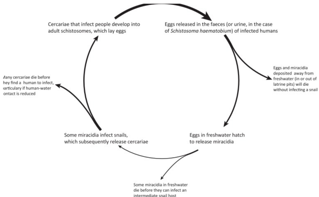
Fig.-Lifecycle of schistosomiasis

fibrosis and consequent portal hypertension [10]. This hepatic fibrosis can be seen in involved cases in endemic zone, which in neglected cases may present as hepatic pseudo tumour appearance making diagnosis difficult [11]. Few studies have found an association between Schistosomiasis and biliary tract malignancies like cholangiocarcinoma [12]. Neglected or untreated cases may develop hepatic, gastrointestinal, splenic and even cerebral complications in later stages [9].