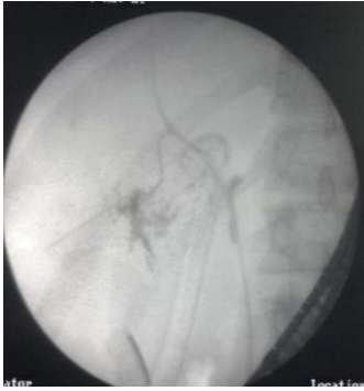
(Fig.1):Leak of contrast in Right posterior sectoral duct