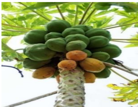
Fig. 1: Carica papaya