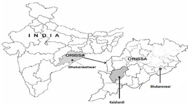
Image 1. Index map of Kalahandi district, Odisha, India

The current research is a wide-ranging survey of various tribal villages in the Niyamagiri hill region and its allied villages of Kalahandi district 2018-19. The Niyamgiri hill is between 19° 26' to 19° 43' N latitude and 83° 18' to 83° 28' E longitude. The hills are situated within the districts of Rayagada and Kalahandi, and NE-SW direction is part of the Eastern Ghats of India. Niyamgiri is covered with dense forests like evergreen, semi-evergreen and deciduous forest. In Niyamgiri, eight different vegetation types are seen, according to local microclimate, plant density, species association and effect of biotic and edaphic factors. Dongria Kandhas are the most dominant tribes, and their language is Odia but kuvi. Every chief leads their tribal groups. Approximately 8,000 population of area present according to 2013 census. These tribal communities are initially nomadic, semi-nomadic communities, but presently living in tribal villages, and each consists of 12-25 families present hilly regions of Kalahandi District, Odisha.