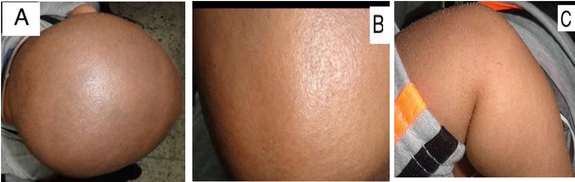
Figure (8): Monilethrix. (A) diffuse hypotrichosis of the scalp in fifth months old male infant , (B) closed up view of scalp showed up sparse short hair with follicular papules and (C) extensive keratosis pilaris involving the thigh of same patient.