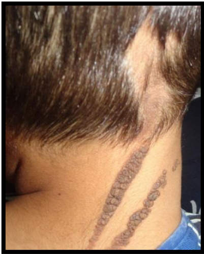
Figure (9): Epidermal nevus involving the scalp in a 5 year-old boy.