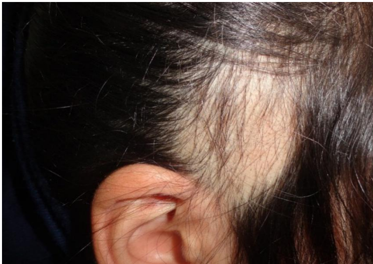
Figure (6): Trichotillomania in a 9 year- old girl.