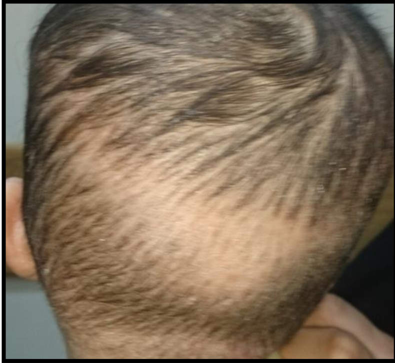
Figure (4): Neonatal occipital alopecia in a 2 month-old infant.

Figure (3): Tinea capitis with varying degrees of hair loss. (A and B) Scaly non inflamed scalp in tinea capitis in a 6year- old boy and a 4 year- old girl and (C) kerion in a 3 year- old patient.