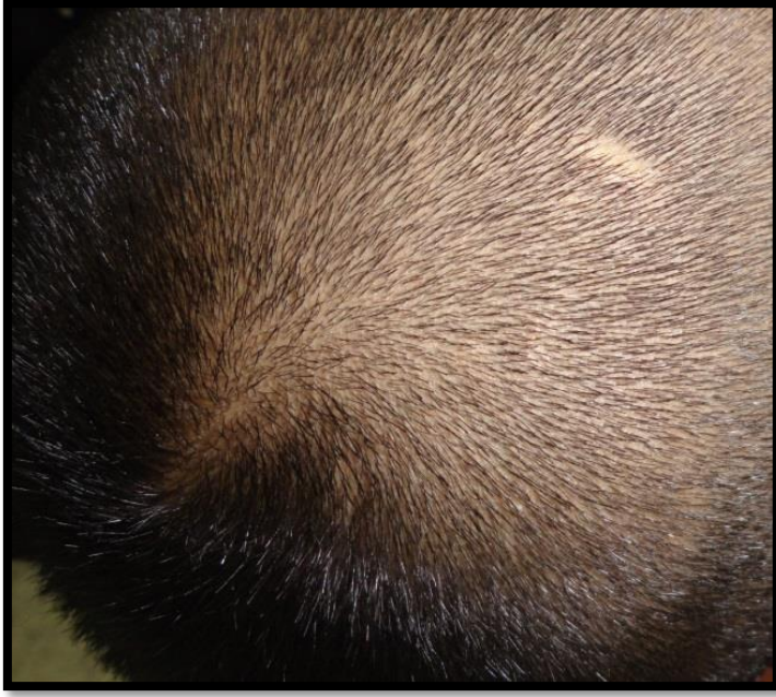
Figure (5): Posttraumatic alopecia in a 6 year- old boy.