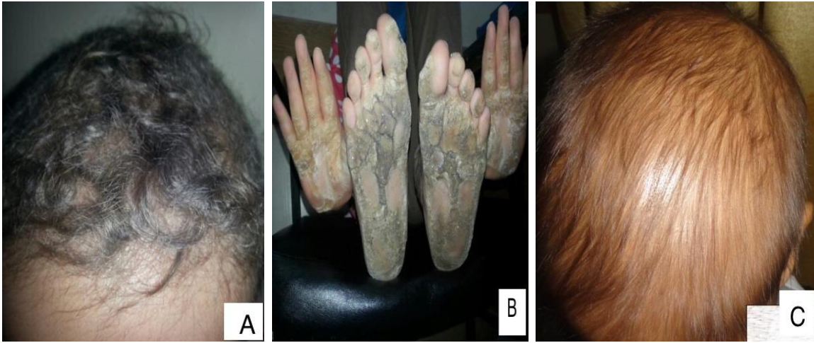
Figure (7): Ectodermal dysplasia.( A and B) Hidrotic ectodermal dysplasia in 11year-old girl with short ,curly hair in (A) and the associated palmoplantar keratoderma in (B). (C) Hypohidrotic ectodermal dysplasia with thinning of scalp hair.