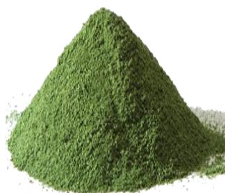
Fig. 1b. Moringa oleifera leaves powder