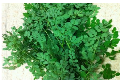
Fig. 1a. Fresh Moringa oleifera leaves

support sustainable land practice use [6]. Researchers at the Asian Vegetable Research and Development Center [7] reported that leaves from four (4) different moringa species ( Moringa oleifera , Moringa peregrina , Moringa stenopetala and Moringa drouhardii ) contained high levels of nutrients, vitamins and antioxidants [6]. Bureau of plant industry reported MO as an outstanding source of nutrients among the Moringa species. Its leaves (weight per weight) have the calcium equivalent of four times that of milk, the vitamin C content is seven times that of oranges, while its potassium is three times that of bananas, three times the iron of spinach, four times the amount of vitamin A in carrots, and two times the protein in milk [8]. The nutritional and medicinal properties of MOL suggest it as a good option for the replacement [9-12,4,13]; hence this study investigated the nutritional composition of Moringa oleifera leaves and the effect of its bio-fortification with animal feed on physical changes and organ weight.