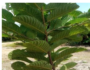
(a) Psidium guajava