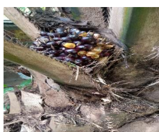
(b) Elaeis guinensis