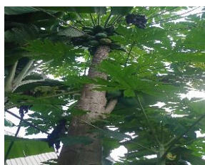
(b) Carica papaya