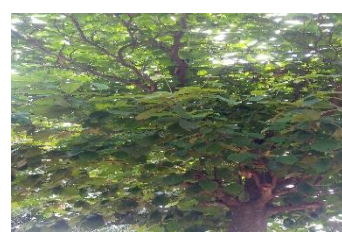
(d) Terminalia catapa