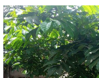
(d) Dacryodes edulis