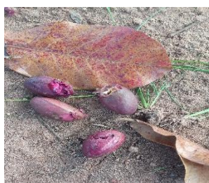
(a) Terminalia catapa