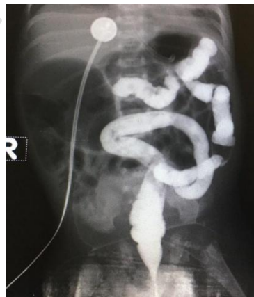
Fig 2 Barium contrast study suggestive of intestinal obstruction