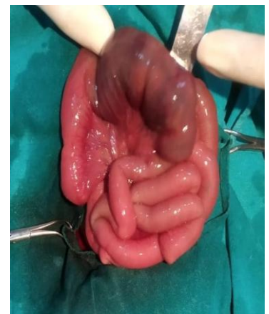
Fig 3 Intraoperative findings of gangrenous bowel loop