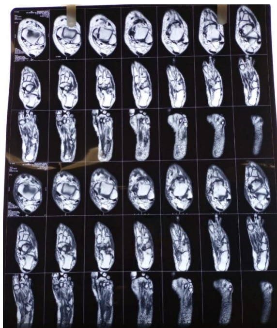
Figure 5. MRI scan image