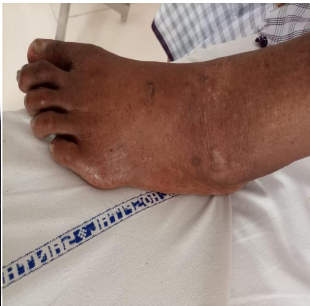
Figure 6. Left ankle swelling