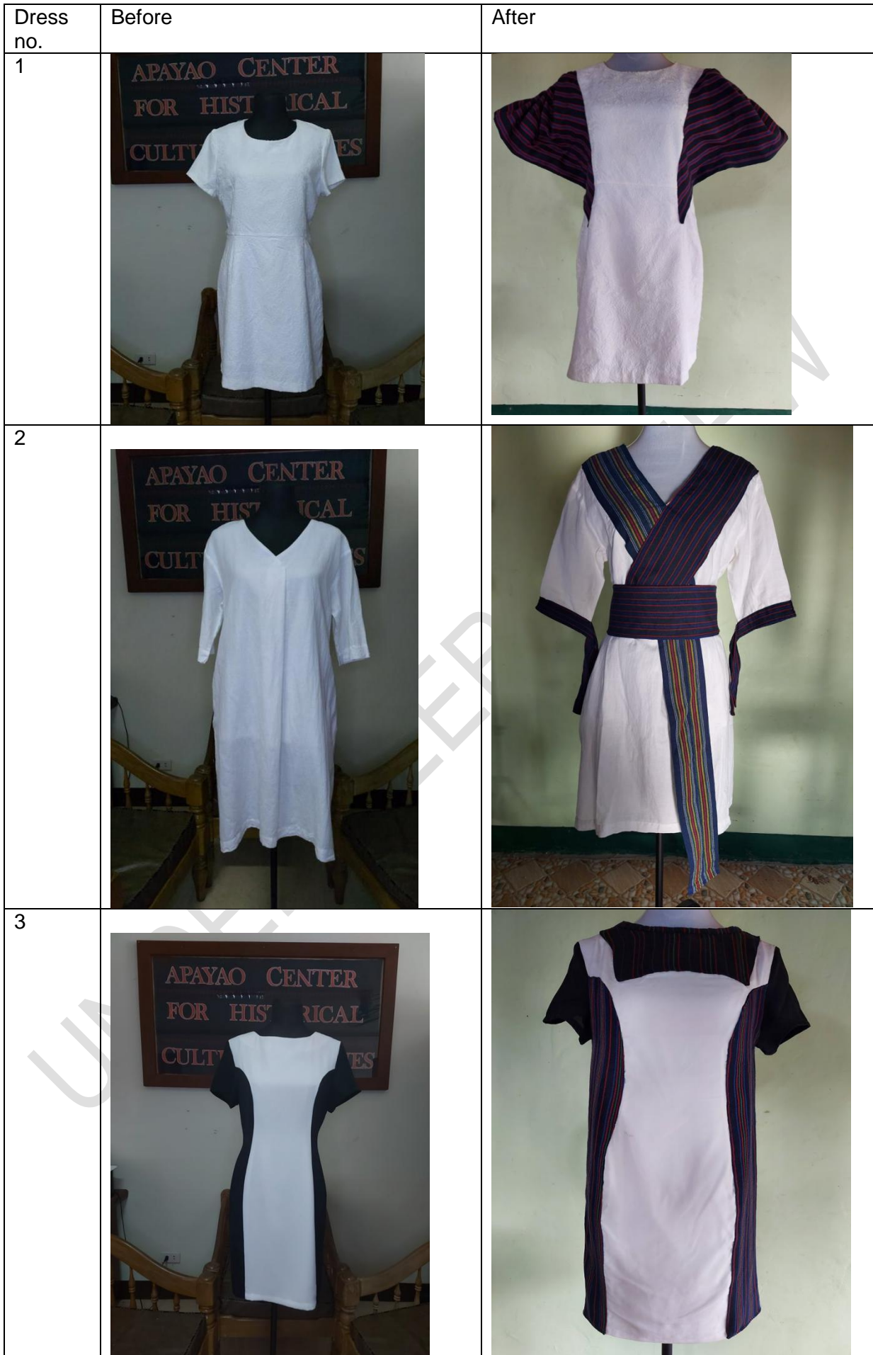
Table 2. Pre-loved dresses before and after accentuated with Apayao textiles