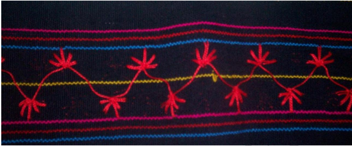
Figure 2. The embroidery symbolizes hand and fingers which depicts the industriousness of the Iyapayao.

burn agricultural system with 4 to 5 years rotational fallow system. They are also engaged in blacksmithing industry, basket weaving, fishing and hunting. These traditional livelihood requires intensive labor for them to produce food and income for their families. The interconnectedness of each embroidered fingers symbolizes the bayanihan system of the Iyapayao which is called “ Ammoyo, Inamoyo, or Tagnawa for building houses and working in the farms. They are closely connected with each other and form themselves into village or Ili .