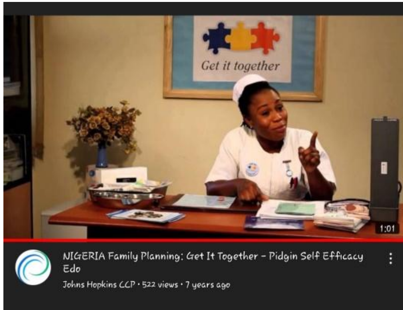
Fig. 1: Advert on Family Planning

Mi people, una get to sabi de main de main tin wey dey for family planning. Na differen differen metod na I dey: