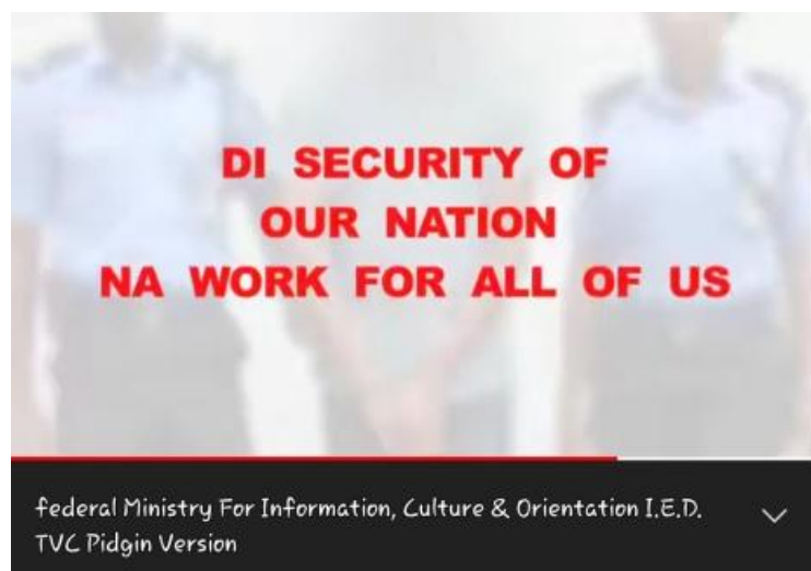
Fig. 4: Advertisement on Security

Nigerians, una sabi wetin be Improvised Explosive Device wey dem dey call (IED)? IED dey come for different size dem. Dey fit hide am inside bag dem, box or different kinds of container dem. Dey fit put IED for inside mineral bottle and de big IED fit dey inside boot for moto.