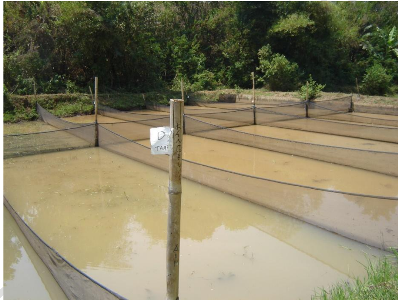
Figure 1. Fishpond cultured

This research was conducted in Ciparanje Pond, Faculty of Fisheries and Marine Sciences, Universitas Padjadjaran and the forage analysis laboratory, Faculty of Animal Science, Padjadjaran University.