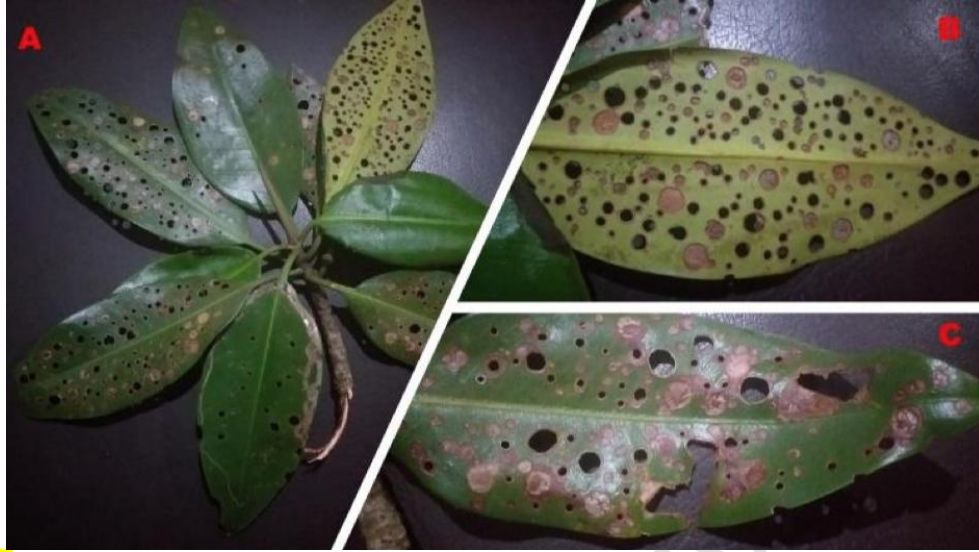
Figure 2. Leaf spot infected R. apiculata leaves (A) infected twig (B) ventral side of the infected leaf (C) dorsal side of infected leaf

There were at least 100 R. apiculata trees in the area that were affected by the anthracnose leaf spot. Almost 85-90% of all sampled leaves were infected by the anthracnose which indicates that the R. apiculata that were thriving in Marabahay, Rio Tuba, Bataraza, Palawan, Philippines was under severe threats of great lost both in terms of quality and quantity (Figure 3).