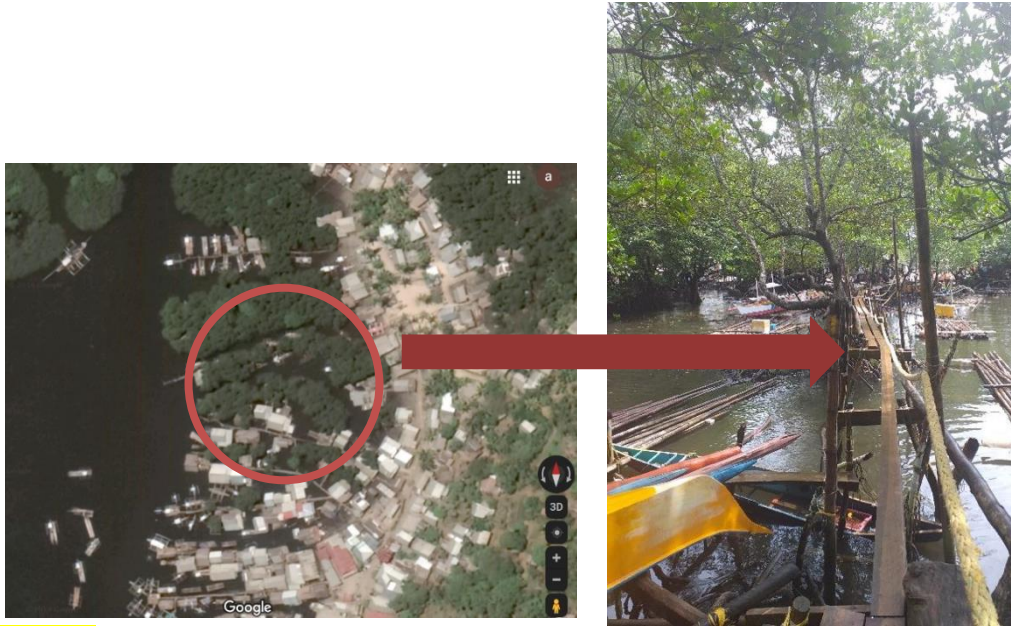
Figure 1. Rio Tuba and its coastal community (settlement area) location map (Source: https://www.google.com/maps/place/Palawan/@11.7802056,117.9055427,6z/data=!4m5!3m4!1s0x33b5bce750b99e45:0xdfc65f6c0c8d3beb!8m2!3d9.8349493!4d118.7383615 ).