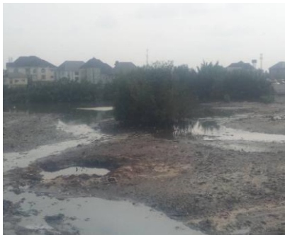
Plate 1: Station 1