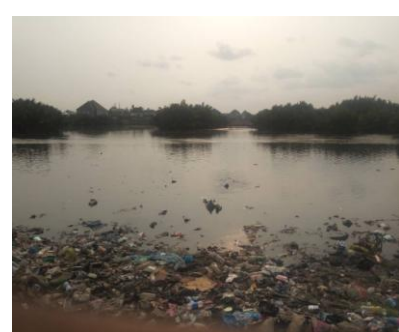
Plate 3: Station 3