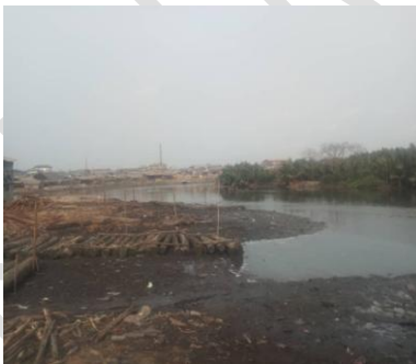
Plate 2: Station 2