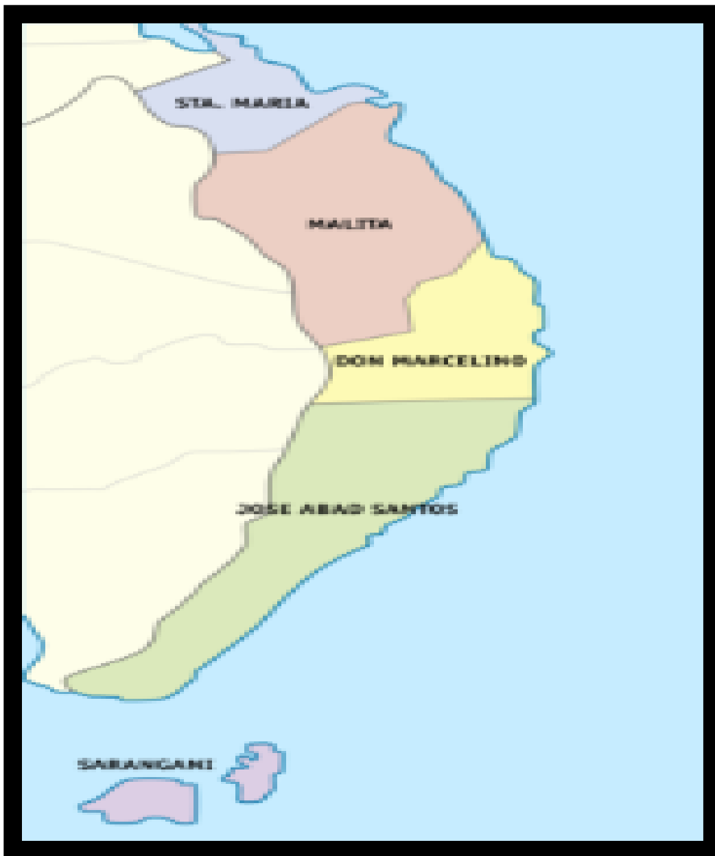
Figure 1. Map showing the research locale of the study.