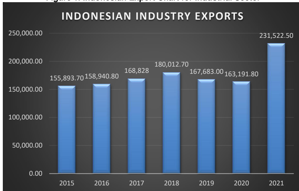
Figure 1. Indonesian Export Chart for Industrial Sector