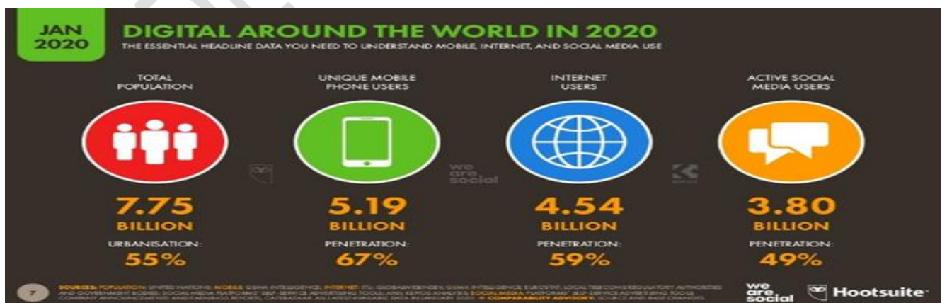
Figure 1 Digital technology around the world

When a brand is created, organizations decisively put hefty stress over public relations, advertising and marketing in order to support their brands. Conventionally, public relation