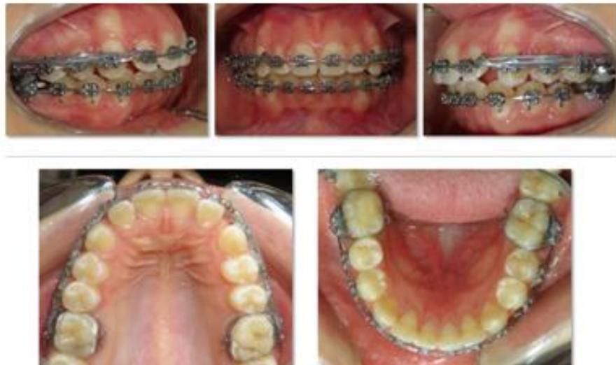
Figure 3. the space-closing phase.

At this stage of treatment, the bite turbos were completely removed and the patient was asked to go back to wearing double class II elastics ( Figure 3 ). This phase also lasted approximately 3 months.