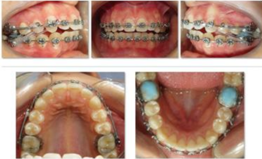
Figure 2. The distalization phase.

After 9 months into treatment, we attained class I molar and canine relationship, and large diastemas (3 mm) were created between maxillary lateral incisors and canines. The upper premolars and second molars were bonded and a maxillary .017x.025 NiTi archwire was ligated. The mandibular archwire was not changed and the patient wore simple class II elastics for about 12 hours per day to avoid relapse. Two months later, we commenced the space-closing phase using sliding mechanics. Maxillary and mandibular .018x.025 stainless steel archwires were ligated. Two omega loops were bent in the upper archwire distal to the lateral incisors and were used as hooks to attach the elastomeric chains.