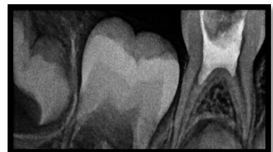
Figure. 3: 15days followup