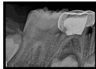
Figure. 9: 1- month follow-up