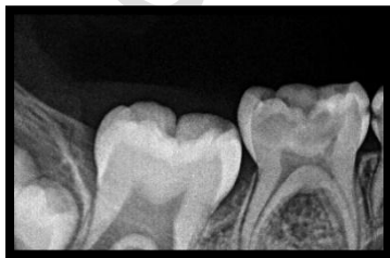
Figure. 7: Preoperative

The child was administered with local anesthesia, Lidocaine 2% with 1:100,000 epinephrine (DENTSPLY, College Ave, York, PA, USA). Following local anesthesia, the caries were removed and the pulp chamber access was obtained. A #10 K-file with RC Prep (Premier, Philadelphia, USA) was used to scout the coronal 5mm of the canals. Irrigation was performed with 1% sodium hypochlorite. TAP was mixed to a ratio of 1:3:3 with propylene-glycol as a carrier. The mixture was placed on the pulpal floor and at the canal orifices of both the teeth. The teeth were then sealed with temporary restoration of zinc oxide eugenol and then restored with stainless steel crowns after 30 days and reviewed after three months after review. 7-8 (Figure. 7-9).