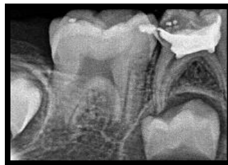
Figure. 8: Postoperative