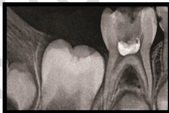
Figure. 2: Postoperative