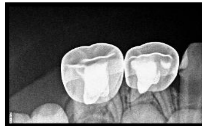
Figure. 6: Postoperative