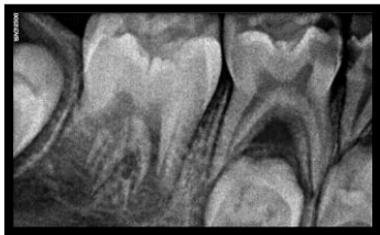
Figure. 1: Preoperative

Following which irrigation was thoroughly performed with saline. 5 Triple Antibiotic Paste was mixed to a ratio of 1:3:3 (minocycline, metronidazole and ciprofloxacin) with propylene-glycol as a carrier. 5 The mixture was placed on the pulpal floor and at the canal orifices. A temporary filling was given with zinc oxide eugenol followed by permanent restoration after 15 days and stainless steel crown on 85 after another one month. (Figure. 1-4). Oral hygiene instructions and diet counselling were given to parents. Recall visits for regular checkup to assess the oral status of the child was scheduled every 3 months. 6