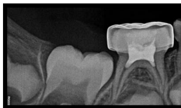
Figure. 4: 1- month follow-up