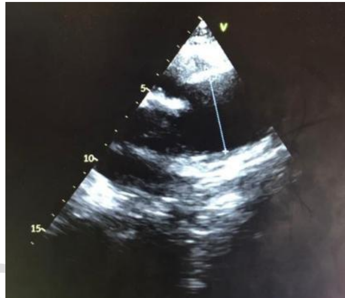
Figure 1 : TTE showing aortic dilation (sinus=38mm, Ascendant=48mm)