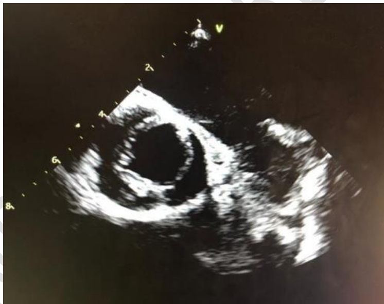
Figure 3 : TEE showing unicuspid and unicommissural aortic valve