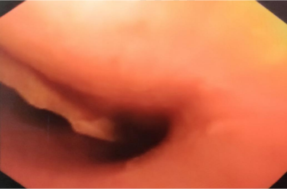
Fig. 3. Right bronchus following removal of foreign body. Chicken bone was removed