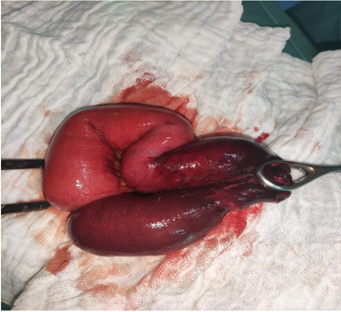
Pic. 2) The image shows the necrotic bowel loop.