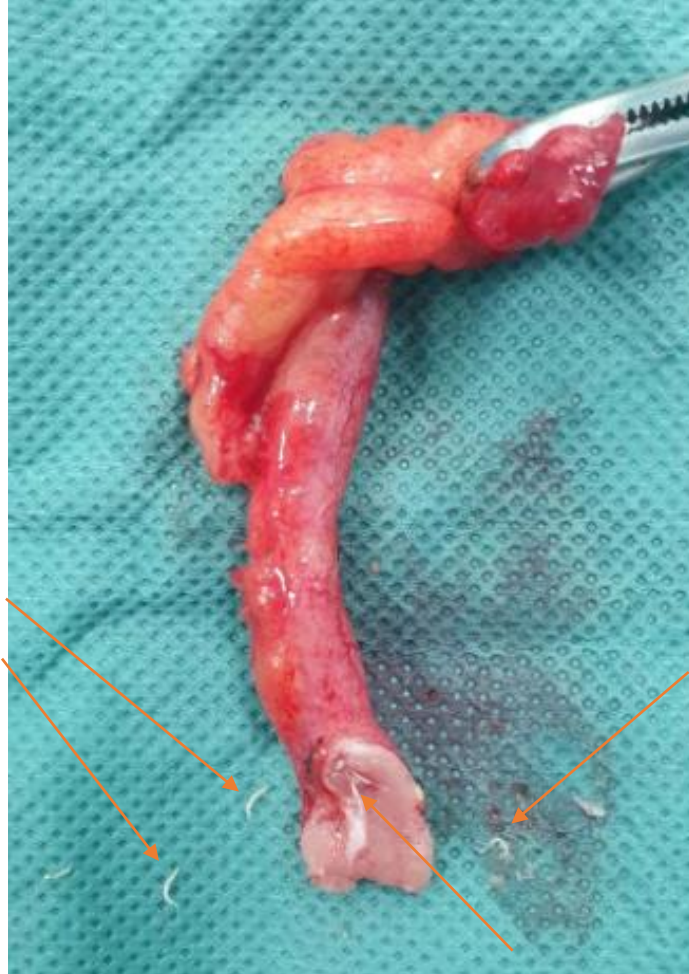
Figure 1. Multiple worms of Enterobius vermicularis after opening of the resected appendix.